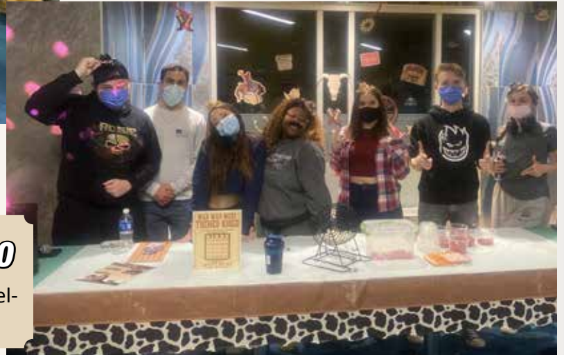
WILD WEST BINGO BINGO gets a new spin! Welcome to the Wild West!