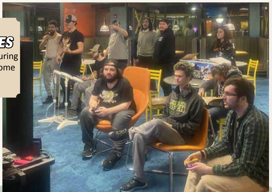
VIDEO GAMES Students relaxed during finals week with some retro gaming.

UPCOMING ACTIVITIES: For more information on upcoming activities, please contact Megan Driscoll, Student Activities Coordinator, mdriscoll@neit.edu or check the NEIT Student Website.