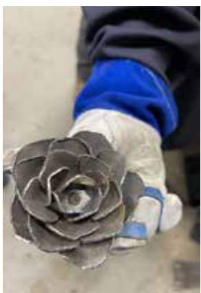
Roses were made from a single piece of sheet metal.

Each year, NEIT offers a new cluster of courses to RIDE for consideration. One popular class currently being offered at NEIT's Access Road campus is welding. The photo shown here is an example of the skills that the welding students have learned after only four weeks of instruction. The class instructor, Michael Sorrentino, said recently, "The students are doing extremely well."