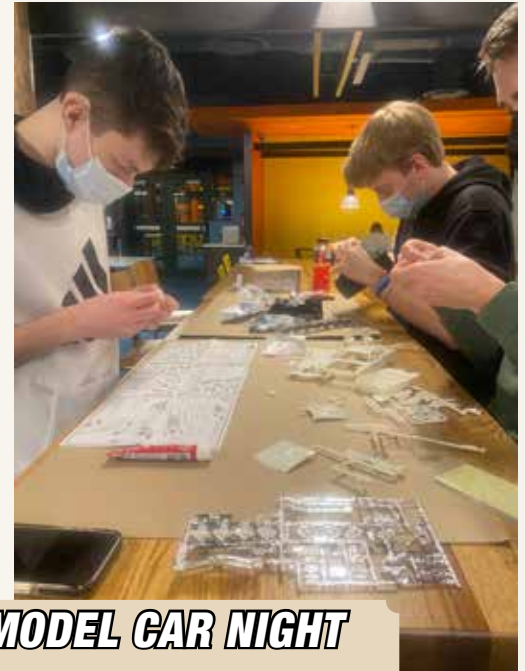
MODEL CAR NIGHT Model car night is always a hit with our students.