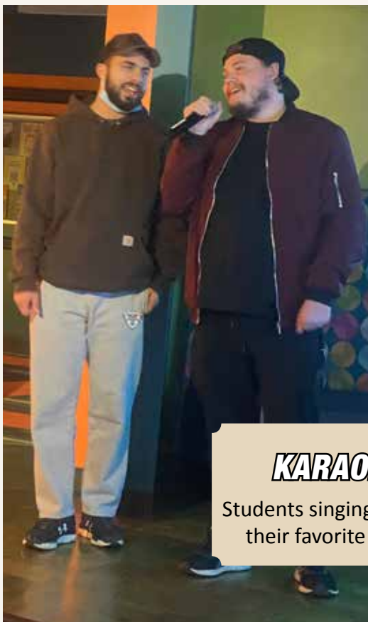
KARAOKE Students singing some of their favorite tunes!