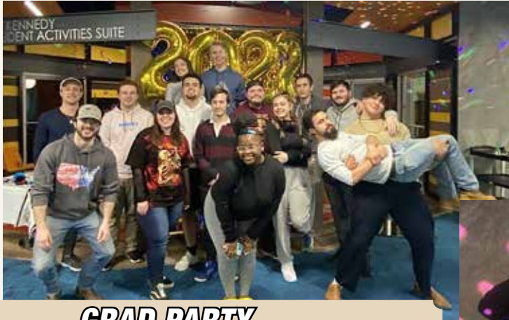
GRAD PARTY We celebrated our soon-to-be grads with a party for all!